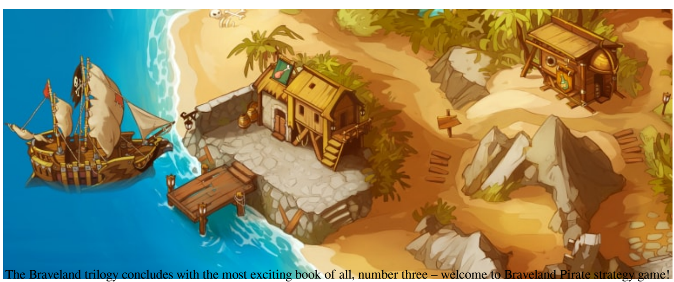
A crew of pirates led by Captain Jim embarks on a search for the Eternal Treasure. Hordes of undead, chests full of gold, devious pirate captains, and breathtaking adventures await you in the Free Islands.